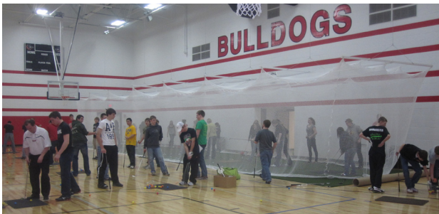
Above: The golf athletes practice in the middle school gym with the new golf nets.